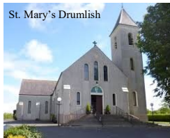
St. Mary's Drumlish

Email: drumlishparish@gmail.com Website: drumlishparish.ie