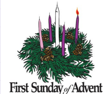
First Sunday of Advent