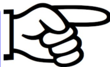
Pointing the Finger!