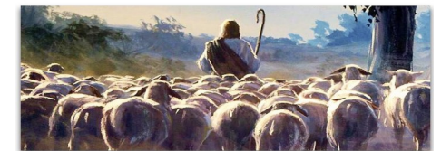
The Lord is my shepherd.

X W Y C T O A Q V B E L I E V E P O E W I U S S T E I L O F A T H E R C O R E W I E R I E N K V N F E N S N G S F D Y P A H I F O L L O W L E Y V Y E H E A R M E