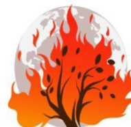
The Burning Bush

I dream a world where man No other man will scorn, Where love will bless the earth And peace its paths adorn I dream a world where all Will know sweet freedom's way, Where greed no longer saps the soul Nor avarice blights our day. A world I dream where black or white, Whatever race you be, Will share the bounties of the earth And every man is free, Where wretchedness will hang its head And joy, like a pearl, Attends the needs of all mankind- Of such I dream, my world!