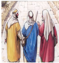
On the Road to Emmaus