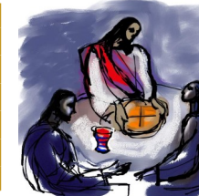
The Breaking of Bread