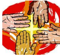
Pray for Christian Unity