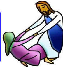
Healing Simon's Mother-in-law