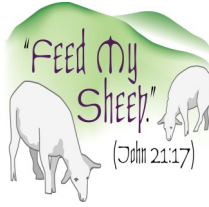
Who will feed the sheep?