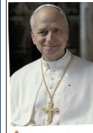
Leo 11 532

Lord Jesus give us happy priests, happy because they know they are called by You and are Your friends. May those who have been given the grace of a priestly vocation welcome it with gratitude and responsibility. May they nourish it with Your Word, Your Sacraments and daily prayer. We ask You Lord for pastors according to Your will: to seek out the lost, serve the poor, and humbly guide those entrusted to them. Mary Mother of Priests, pray for us. St. Isoeph, Father of Priests, pray for us.