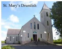
St. Mary's Drumlish

Email: drumlishparish@gmail.com Website: drumlishparish.ie